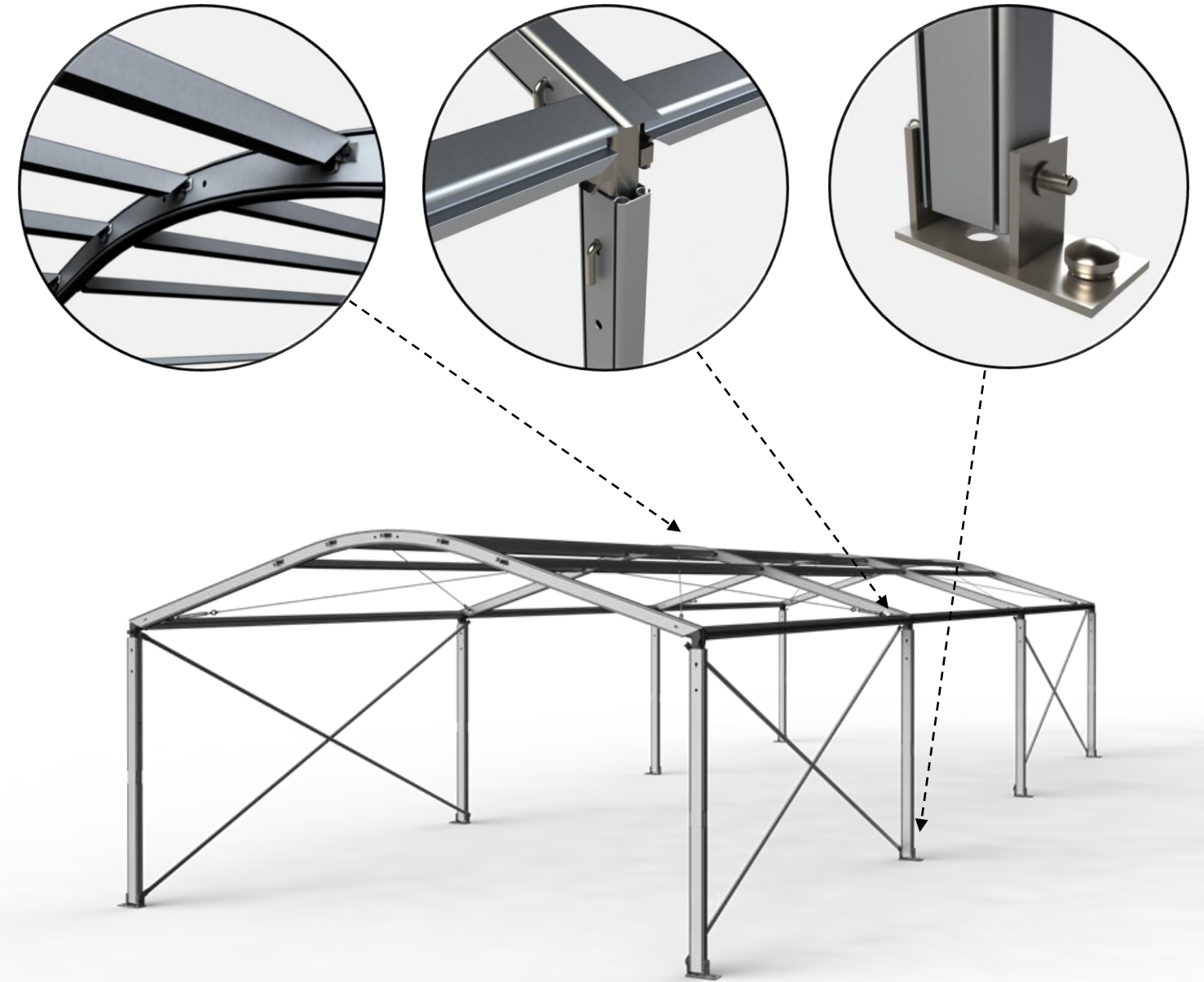
Digital impression; The actual tent will differentiate depending on chosen options