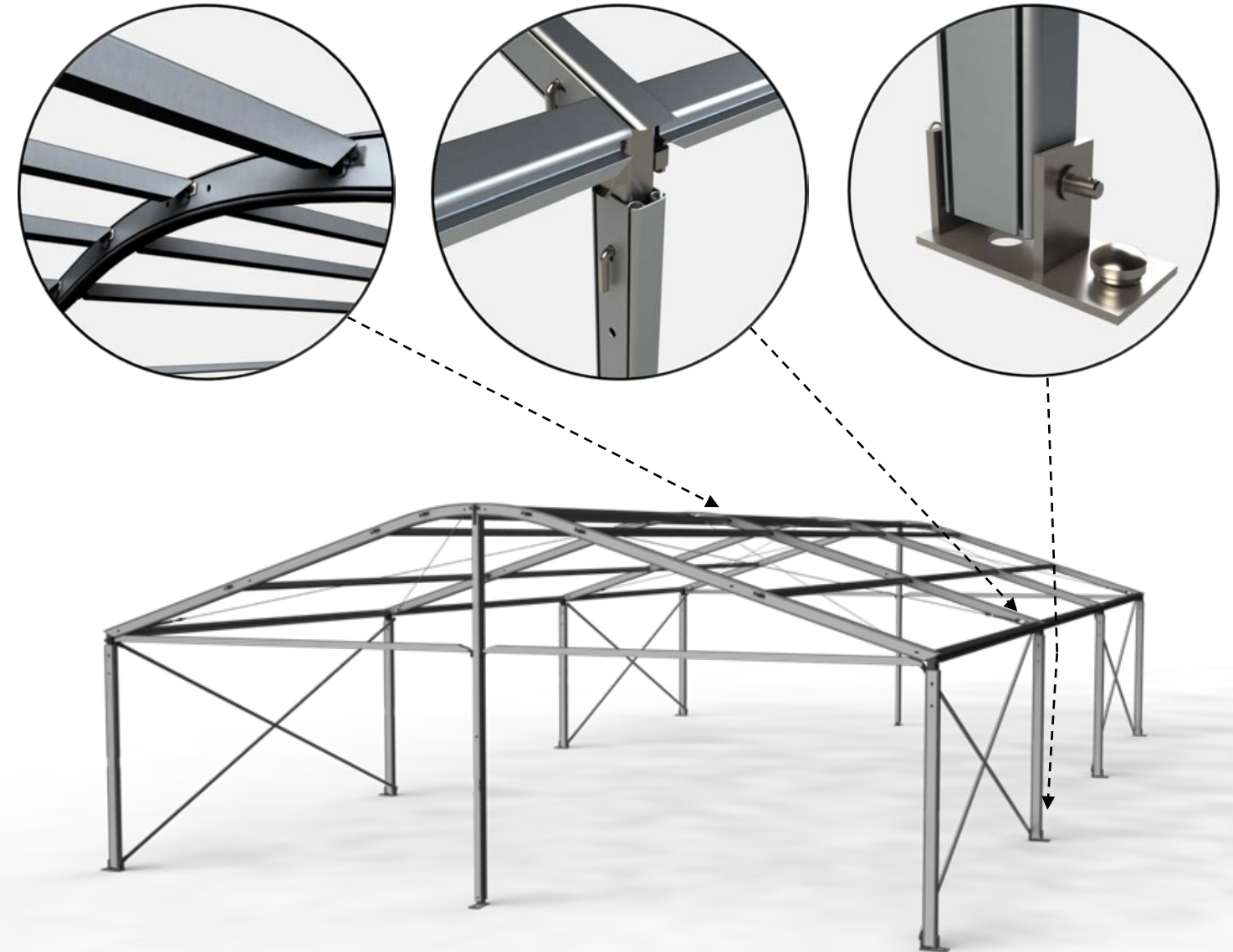
Digital impression; The actual tent will differentiate depending on chosen options